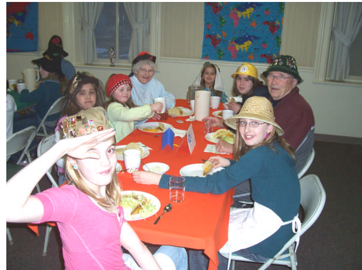
Table parents and their family on 'International Night'

Early Dismissal Children may be released early from WNL ONLY with a detailed note, signed by their parent, for the day they will leave early.